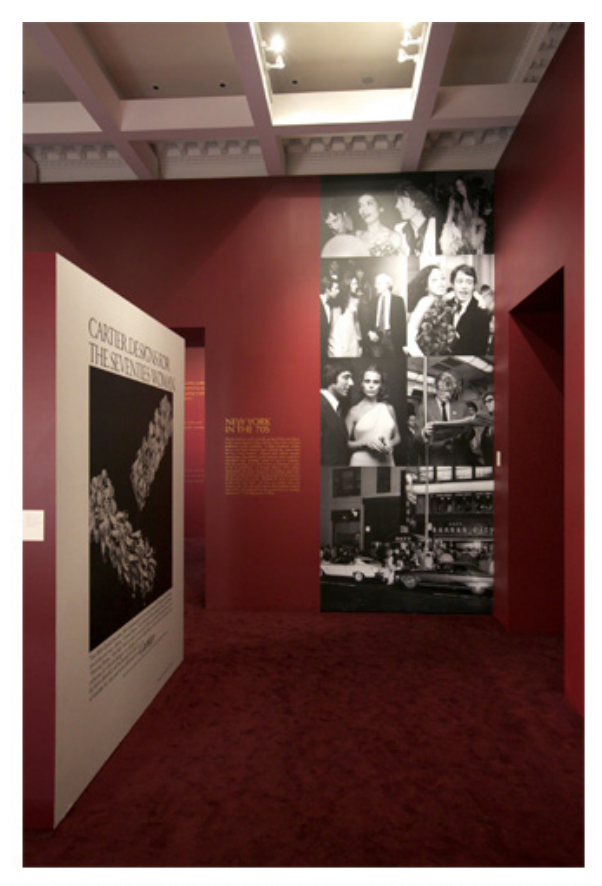
PHOTO OF CARTIER & ALDO CIPULLO NEW YORK CITY IN THE 70S