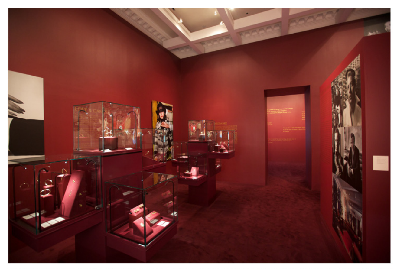
PHOTO OF CARTIER & ALDO CIPULLO NEW YORK CITY IN THE 70S