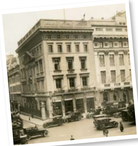
The first Cartier office and store, circa 1917—and still in use today